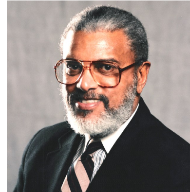
James C. Fletcher, Jr.